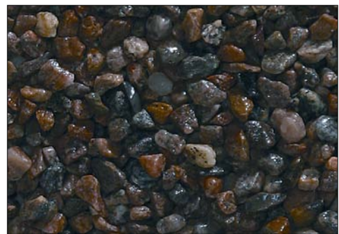
The Rådasand in natural size in dry (top) and wet (bottom) condition. Colour reproduction may vary due to printing process used.

Product specification sheet: 3.0-5.0 mm, rev 2.0. Contains basic technical data. Valid until 2008-12-31. Rådasand AB reserves the right to change specifications without giving prior notice.