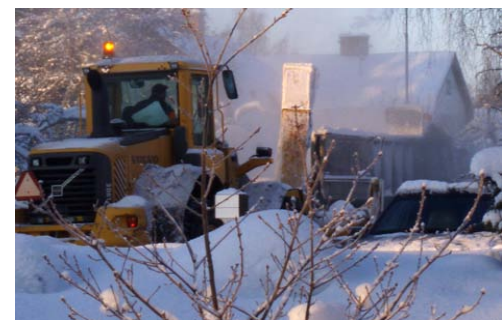
Rådasanden in natural size in dry (top) and wet (middle) condition. Colour reproduction may vary due to printing process used.

Product specification sheet: Ice grit coarse grained rev 1.0. Contains basic technical data. Rådasand AB reserves the right to change specifications without giving prior notice.